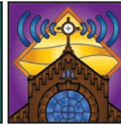
Marketing, Communications, & Membership