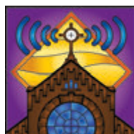
Marketing & Communications